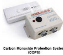
Carbon Monoxide Protection System (COP8)