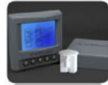
EvrSafe 138-1040 Integrated Safety System