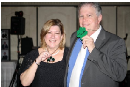
Busted Shamrock Award goes to: