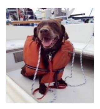
TRUFFLE, The Boating Safety Dog!!!!