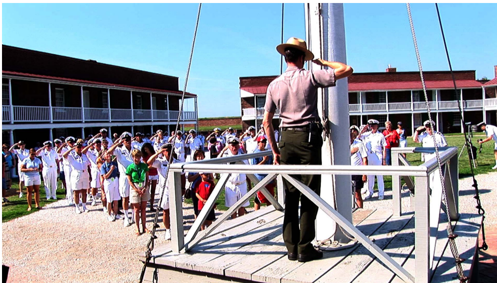
Ft. McHenry Flag-Raising 19 July