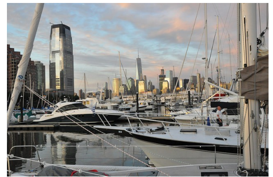
3rd Right The view from our boats. The Colgate Tower in Jersey City is in the left foreground and Manhattan in the background.