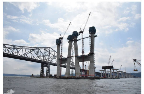
4th Right The new Tappan Zee bridges being constructed. A few days after we went under it one of the cranes collapsed onto the existing bridge.