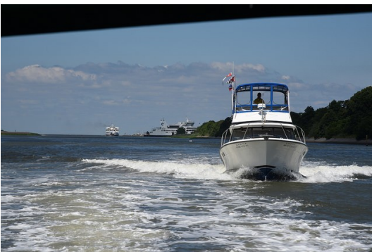
3rd left: After Hours II arriving at Cape May. Lorenzo and Battlewagon are just leaving Worton Creek at the same time.