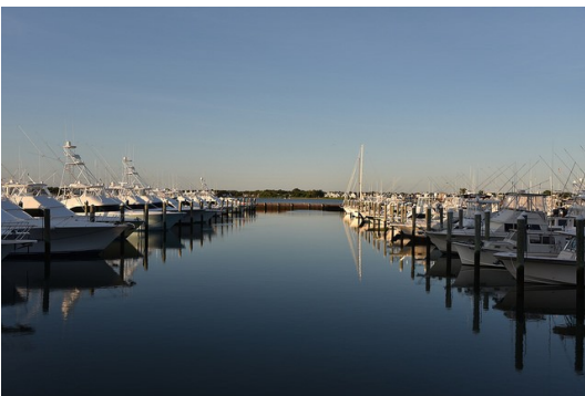
4th Left: The view from the infinity pool at Canyon Club.