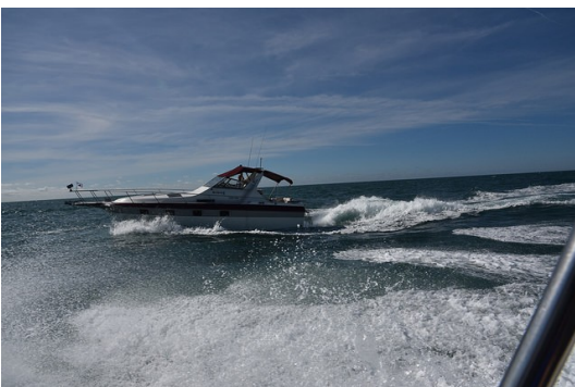
Bottom Left: We had a nasty short chop for the long long run from Cape May to New York Harbor. Yes the sea was angry that day.