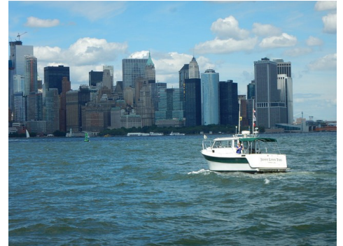
2nd Right: We have arrived! There is no other skyline like that one.