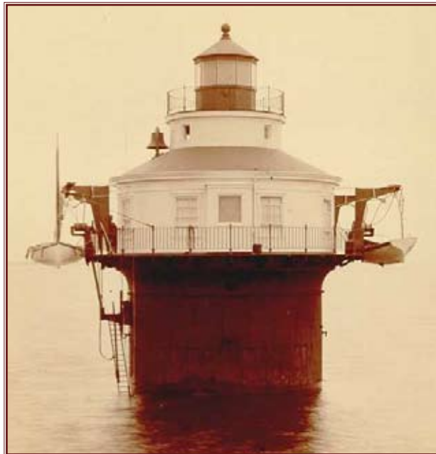
In somewhat better days.

As a lifelong lighthouse enthusiast, I founded HPP in 2001 for the purpose of preserving lighthouses that are threatening to disappear due to neglect and lack of funds. Our philosophy is to preserve as much of the original look and feel of the lighthouse as possible, and restoring it back to life when keepers lived inside, then ultimately open it to the public. Not many lighthouses are currently available for public access, particularly off-shore lights, so I feel we are on the edge of a new preservation and historic education era and very excited at the prospect. For more information regarding membership with HPP, the history of the Craighill Range lights, and our immediate and long-range plans for restoration and preservation, visit the newly launched Craighill Range website, www.craighillrange.org . We also sport an online gift shop, just in time for the holiday season. We look forward to getting to know you!