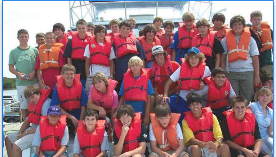
Kids enjoying Seaclusion