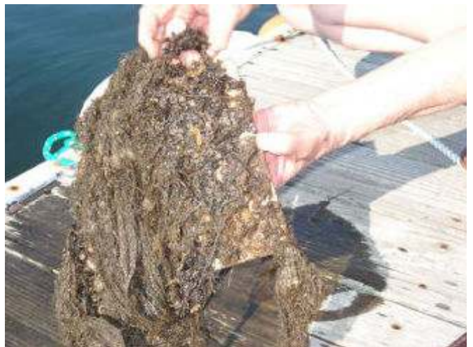
This picture shows the uncoated side of the test panel. The back is covered in grass, barnacles, and mussels so much that the test panel surface is barely visible.