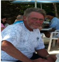
The 2 nd picture "My New Dew" - for awhile.

We left Bowleys Marina on November 10 th . On the way here, we stopped at Deltaville, VA; Coinjock, NC; Oriental, NC; Swansboro, NC; Wilmington, NC; Georgetown, SC; Charleston, SC; Beaufort, SC; Brunswick, GA; St. Augustine, FL; Cape Canaveral, FL; North Palm Bay Beach, FL; Delray Beach, FL; Ft/ Lauderdale, FL and Miami (Pelican Harbor Marina).