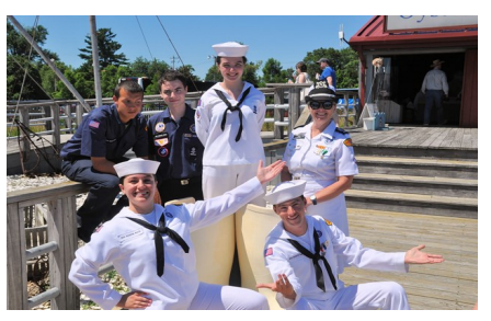
The next event is "The Wurst Cookout Ever"

– July 13<sup>th</sup> through the 15<sup>th</sup> at the Red Eye Yacht Club. If you can't come for the weekend, consider stopping by on Saturday for the cookout 3:00 PM until???? At 5:30 pm there will be a "first time" Kayak/Dinghy Navigation Contest. Can you imagine that?? This should be Fun to participate, or just watch. See the enclosed flyer for more details.