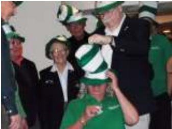
Let's see if it even fits!??