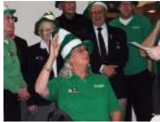
I Swear I Do!!!