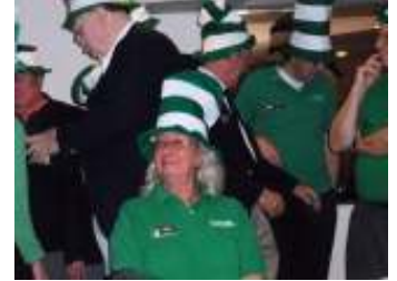
Looks like I'm In!! :-)