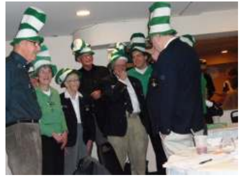
And More Discussion