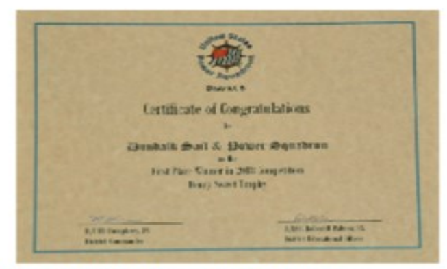
First Place Winner in 2018 Competition for Henry Sweet Trophy