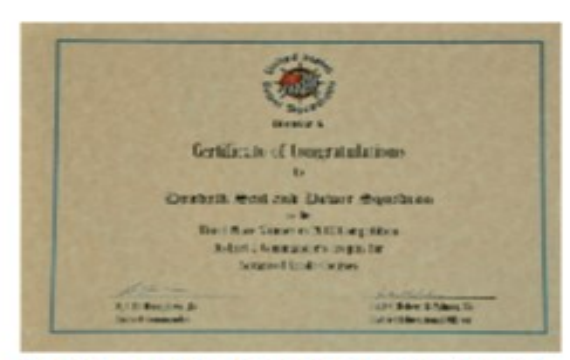
3rd Place 2018 Commander's Award For Advanced Grade Courses