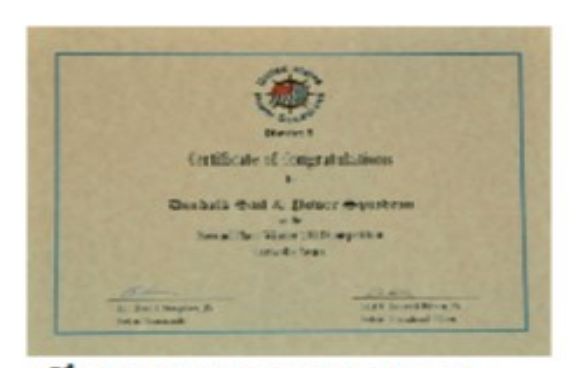
2<sup>nd</sup> Place 2018 Caravelle Award