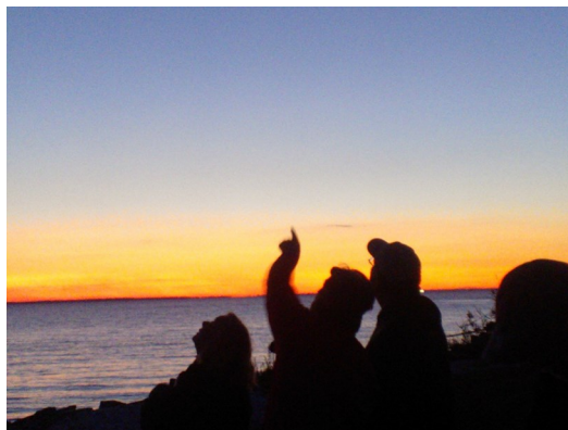
Looking for Stars at Twilight

There was much enthusiasm for repeating the event next year... stay tuned and stay in touch! Send email to SFRUDY@gmail.com to be on the advance mailing list for 2018.