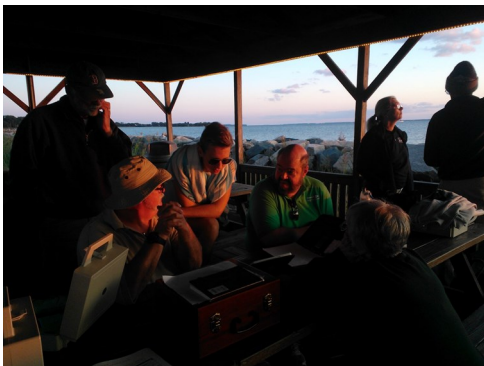
Sharing Knowledge in the Pavilion