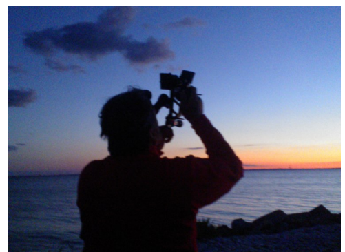
Sight Taking with Sextant