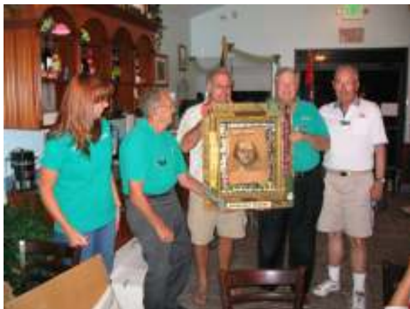
Dundalk brings home Sourpuss from D/5 Summer Rendezvous