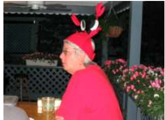
Pajama Party—Haven Harbour Friday, August 22