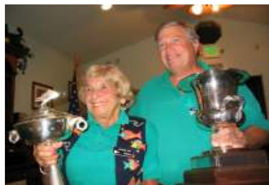
Navigator and Captain accept trophies as top Dundalk Boat in D/5 Navigation Event