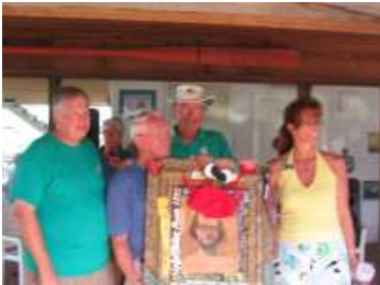
Dundalk, home of Sourpuss!