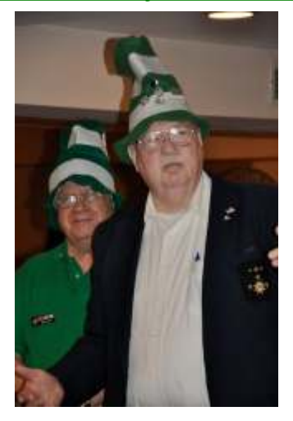
Well is she??