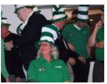
Looks like I'm In!! :-)