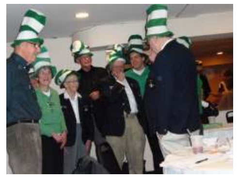
And More Discussion